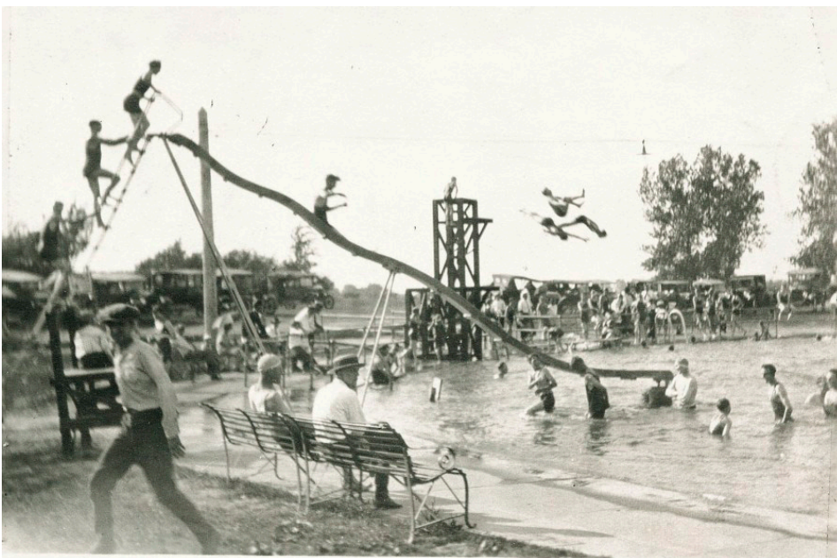
Pool at Northeast Park

Hopefully 2019 will push us back over $200 million. If we all work to shop goods and services locally, it should be a reality.